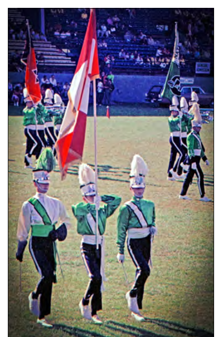
1968: Toronto Optimists

What the Optimists thought of all this is unknown but not hard to imagine. They likely assumed that if they gave up and relaxed, their time was certainly up. Not being this way inclined, they were off to Sarnia on the following weekend. Significantly, De La Salle took the whole weekend off. While