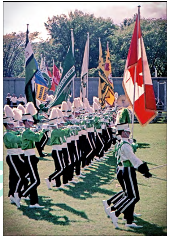
1968: Toronto Optimists Off The Line