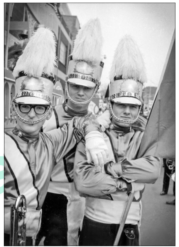
1968: Some guys at Grey Cup Parade

Fund raising this year was helped out by the Optimist Club, who ran a weekly bingo on Monday nights. No matter how successful the Corps was on the field, prize money alone could not cover costs, not even combined with outright grants from the Optimist Club. Fund raising activities were as much an annual necessity as putting the Corps on the field.