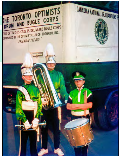
1968: Members of Optimists & Cadets in front of "new" equipment truck

For the first time in seven years, De La Salle beat the Optimists at a full field show, in Canada. La Salle Cadets were stuck in third place, three points behind the Optimists who were, themselves, one point behind Del.