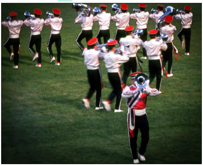
1968: La Salle Cadets