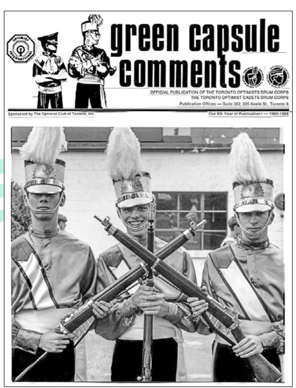
1968: Cover from GCC

Among other things, it outlined a code of conduct that included such things as, "be superior, but friendly", and "always behave like gentlemen". These were tall orders, but there was far more to this book, which is what it was, than just rules of conduct. It covered almost every aspect of the Corps and its activities that could be thought of. Whether anybody ever learned, or even read, the whole thing is debatable. Certainly, if everybody had read and followed all of its dictates, this would have been the best Corps in the world.