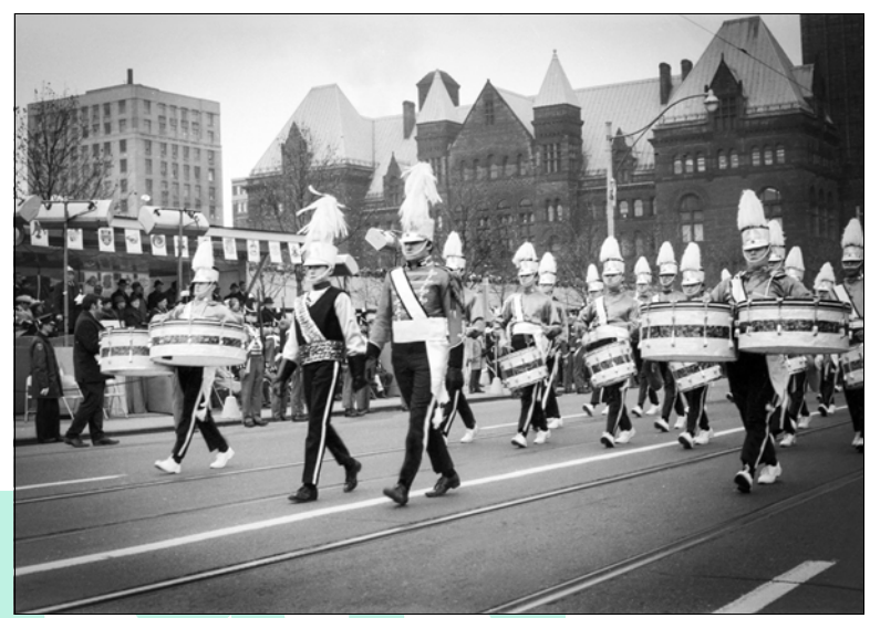
1968: Toronto Optimists in the Grey Cup Parade

A letter pointing all this out was sent, by the Director and Assistant