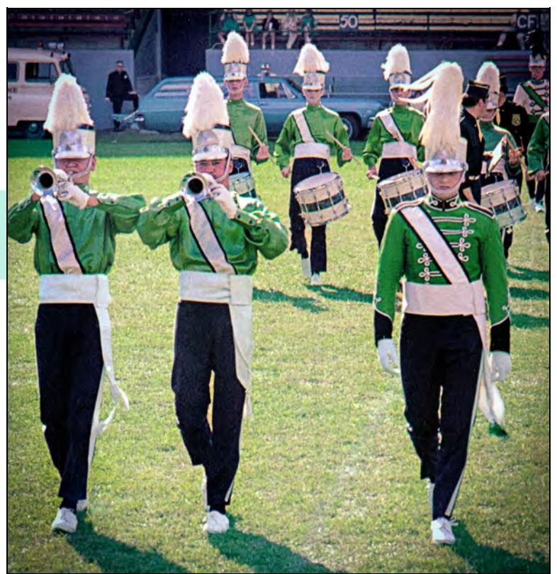
1968: Toronto Optimists

Reinforcing their confidence, the Optimists had won the prelims, with Del second and La Salle third. Unexpectedly, their victory was by two points, increasing the margin of the previous week.