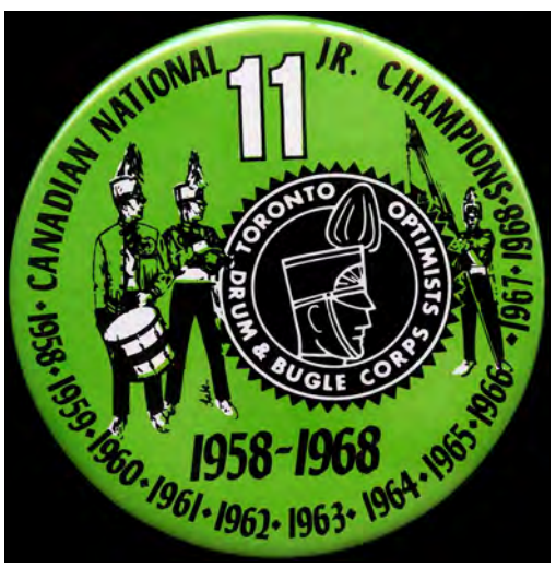
1968: Toronto Optimists 11 year button

5. This record included winning the Ontario Championship ten years in a row, the Canadian National Exhibition seven times, and, of course, the Canadian Championship for eleven consecutive years. South of the border, they had won the New York Canadian title four times.