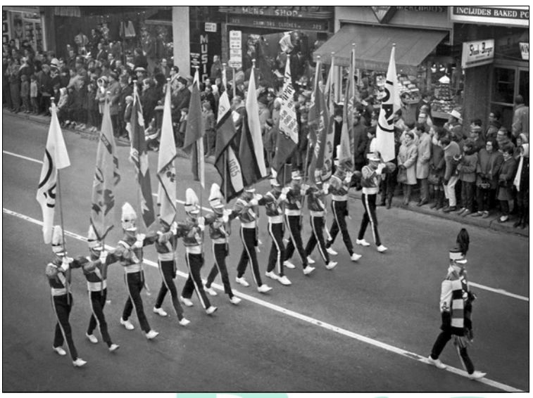
1968: Toronto Optimists Colour Guard in Grey Cup parade (note the Argo scarf)

Earlier in this chapter, mention was made of an Optimist Club magazine published this year. It was the November issue that devoted an article to the Toronto Optimists Drum and Bugle Corps. This magazine covered the entire range of Optimist Club activity, continent wide. Reading this, one becomes aware of the total picture. The Optimist Club is a huge organization devoted to good works of every description. To relate the whole range of its endeavours would take not a book but a library. In this ocean of benevolence, the Corps was just a drop of water.